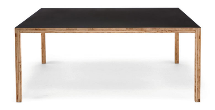
Table Caruso St John